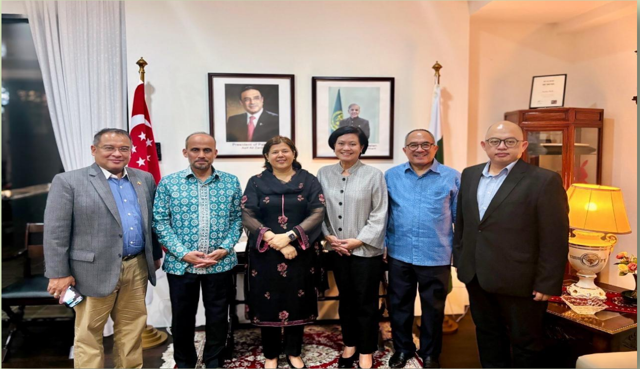
The High Commissioner hosted ASEAN Ambassadors/High Commissioners to dinner at her place. 17-04-2024