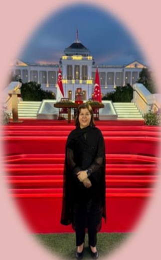
High Commissioner Rukhsana Afzaal attended the swearing in ceremony of Prime Minister Lawrence Wong at the Presidential Palace. The new cabinet also took oath of office at the ceremony. Mr. Lee Hsien Loong became Senior Minister in the new cabinet after serving the nation as Prime Minister for 20 years.