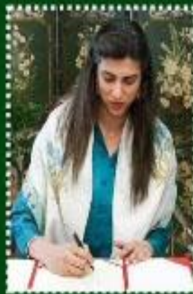
Rabia Shafiq Pakistan High Commissioner, Singapore