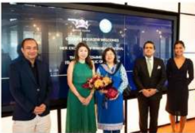
Visit to Golden Equator Company 04 May 2023